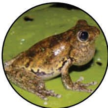
Peron's Tree Frog Litoria peronii