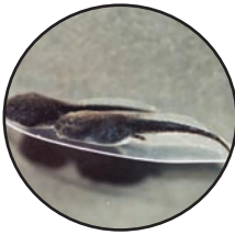
Cane Toad tadpoles