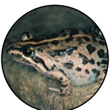
Spotted Marsh Frog Limnodynastes tasmanensis

To find out more go to www.nationalparks.nsw.gov.au