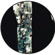
Cane Toad spawn