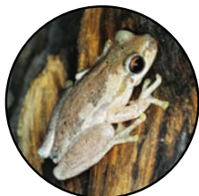
Bleating Tree Frog Litoria dentata

Frogs commonly mistaken as Cane Toads in New South Wales: