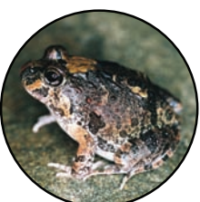
Ornate Burrowing Frog Opisthodon ornatus