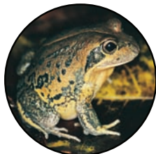
Scarlet Sided Pobblebonk Limnodynastes terraereginae