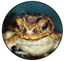
Young adult Cane Toad

Cane Toads are a serious threat to the unique native wildlife in New South Wales because: