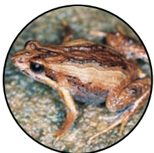
Common Froglet Crinia signifera